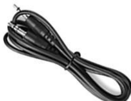
3.5mm Cable 1.5M * 1