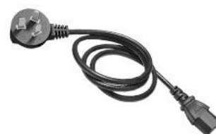
Power Cable 1.5M * 2