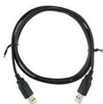
USB-A Cable 1.5M * 1