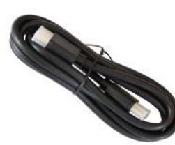
HDMI Cable 1.5M * 2