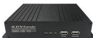
RX * 1