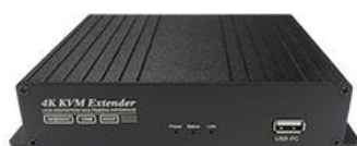
TX * 1